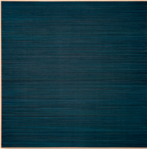
Untitled – 2009 – Acryl auf Leinwand – 80x80 cm