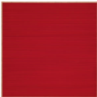
Untitled – 2011 – Acryl auf Leinwand – 40x40 cm