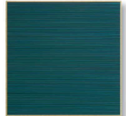
Untitled – 2011 – Acryl auf Leinwand – 40x40 cm