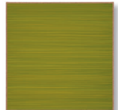
Untitled – 2011 – Acryl auf Leinwand – 40x40 cm

For more than 10 years I have been investigating a limited range of colors in my paintings. I like to call them "polychromatic monochromes". From a distance my paintings can often be conceived as monochrome paintings, but when you come closer, there are many different colors, pigments and hues in and around the main color and also a diversity of matt and glossy surfaces. The simplicity is actually very complex.