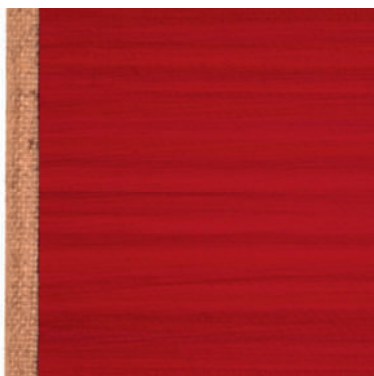
Ausschnitt aus Untitled – 2011 – Acryl auf Leinwand – 40x40 cm

Lars Strandh wurde 1961 in Gothenburg/Schweden geboren, er lebt und arbeitet in Oslo/Norwegen.