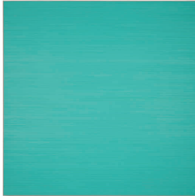
Untitled – 2011 – Acryl auf Leinwand – 130x130 cm