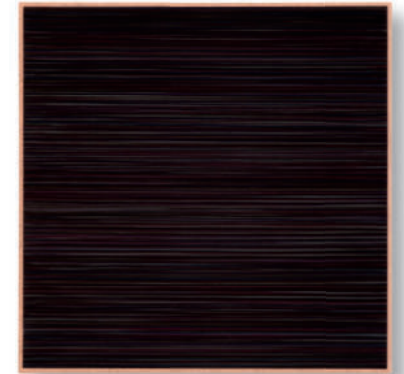
Untitled – 2011 – Acryl auf Leinwand – 40x40 cm